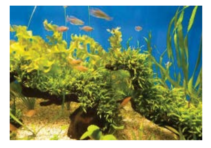
Fig. 1. Schematic diagram of marine plants.

From Table 1 we can see that the overall satisfaction of experts and students for current evaluation of physical health is not high, which is mainly concentrated in dissatisfaction. Ten experts have expressed dissatisfaction for current monitoring and evaluation of students' physical health. In addition, no expert is very satisfied with the current evaluation of physical health. Only ten students are very