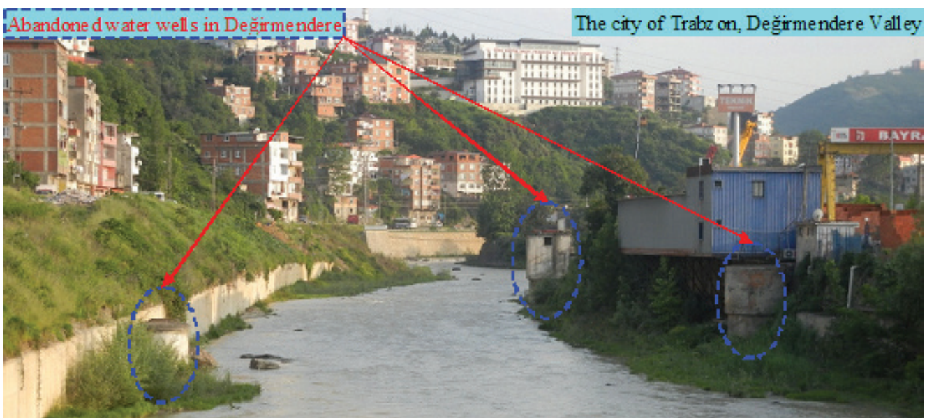
Fig. 1. View from several water wells disused for a long time in the Değirmendere Stream (Trabzon Province, Turkey) by the author on May 12, 2014.

The total population of Trabzon is 757,898, and 56.3% of population live in city centers according to the 2012 census [46]. Sanitary sewage systems serve 454,306 people