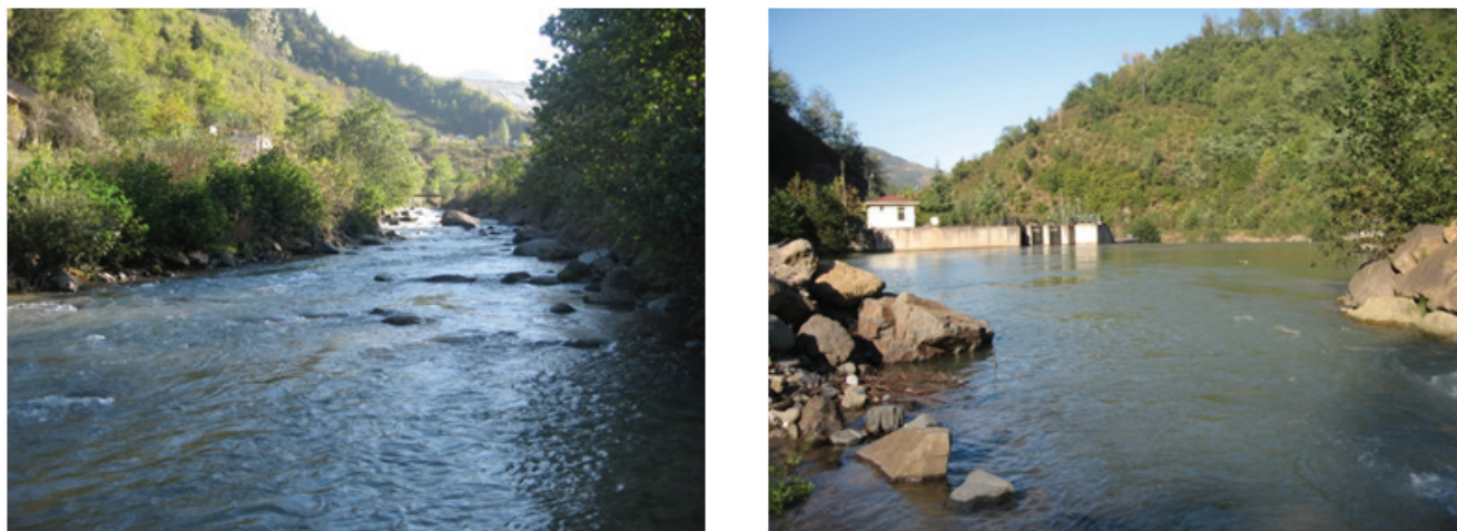
Fig. 3. Views from the regulator on the Galyan Stream (Trabzon Province, Turkey) by the author on November 3, 2010.

according to the Municipal Wastewater Statistics Survey in 2012 [47]. About 23.474 \times 10^6 m 3 per year of wastewater are generated, 20.472 \times 10^6 m 3 of which are discharged by deep sea discharge systems to the Black Sea, and 2.912 \times 10^6 m 3 of which is discharged through the streams to the Black Sea [47]. As a result of all this discharge, coastal eutrophication occurs.