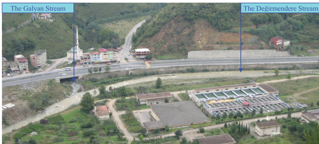
Fig. 5. View from the drinking water treatment plant in the Değirmendere Valley (Trabzon, Turkey) by the author on September 30, 2014.

the water. Rapid mixing is achieved in the first mixer (M1) having one weir and four baffles. The flocculant, such as polyelectrolyte, is then added. Flocculation is achieved in the second mixer (M2) by gentle mixing so as to maximize the number of collisions between suspended particles and flocs, without breaking the flocs up through rapid mixing. The treatment plant has four rectangular clarifiers, each of which has a base width of 432 m 2 and a volume of 1,950 m 3 . There are seven rectangular sand filter beds, each of which has a base width of 134 m 2 and a volume of 750 m 3 . Each gravity rapid sand filter has a filter media of 1,050 mm (Table 1). There is also a clean water tank of 12,000 m 3 in the plant.