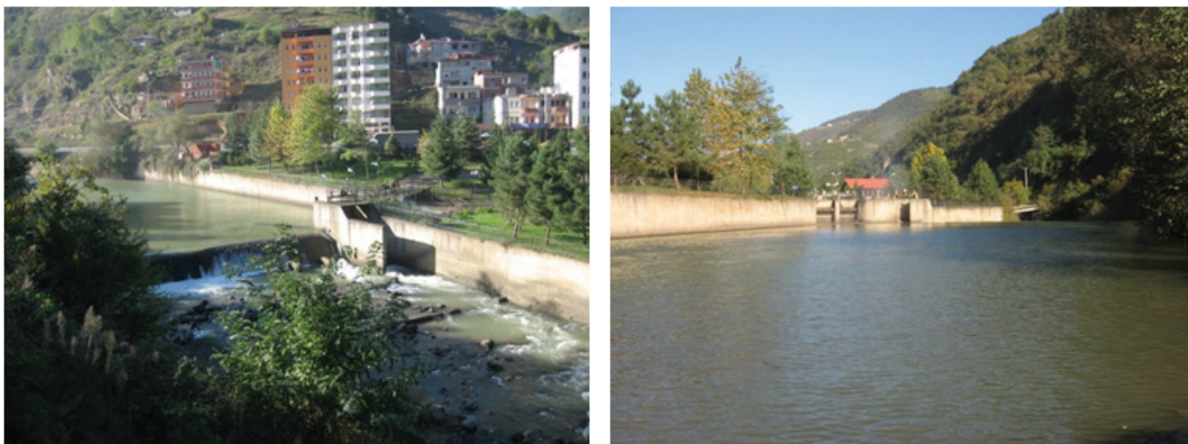
Fig. 2. Views from the regulator on the Değirmendere Stream (Trabzon Province, Turkey) by the author on November 3, 2010.