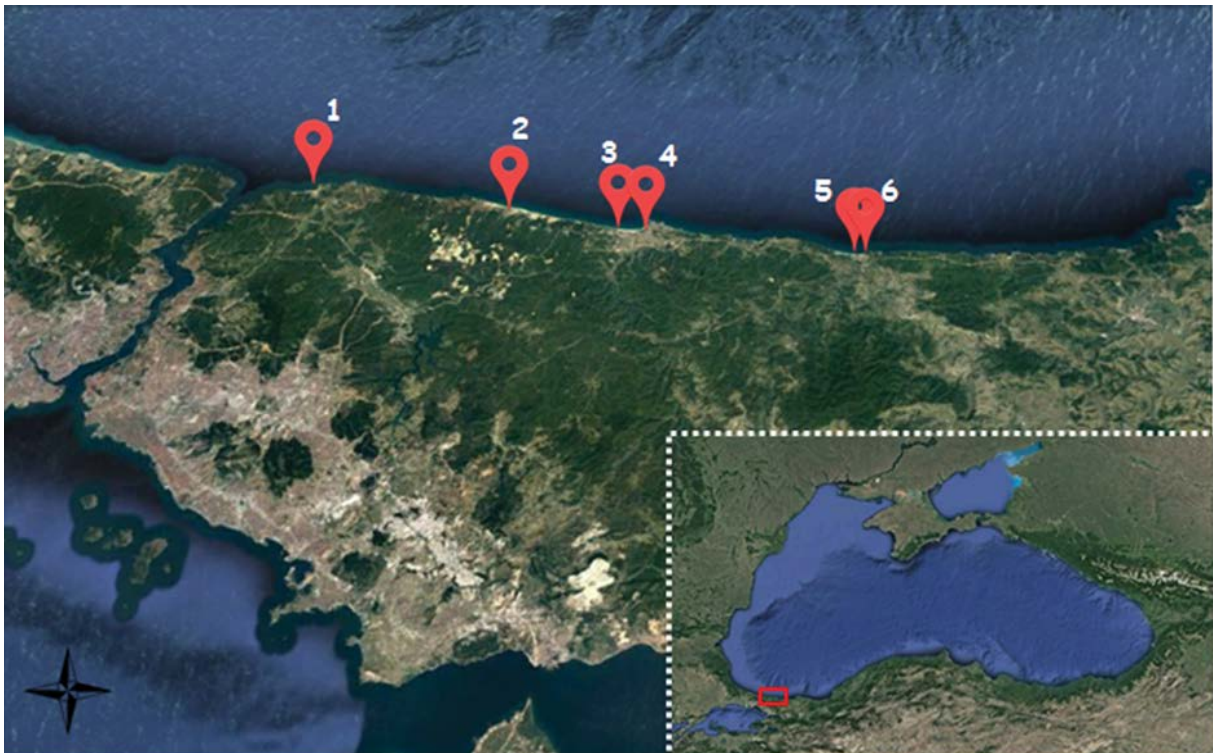
Fig. 1. Map of the study area (1: Riva, 2: Alacali, 3: Kumbaba, 4: Sile Port, 5: Kurfalli, 6: Agva).

The abundance by number and weight of the plastics were presented as the number of plastics per kg of dry beach