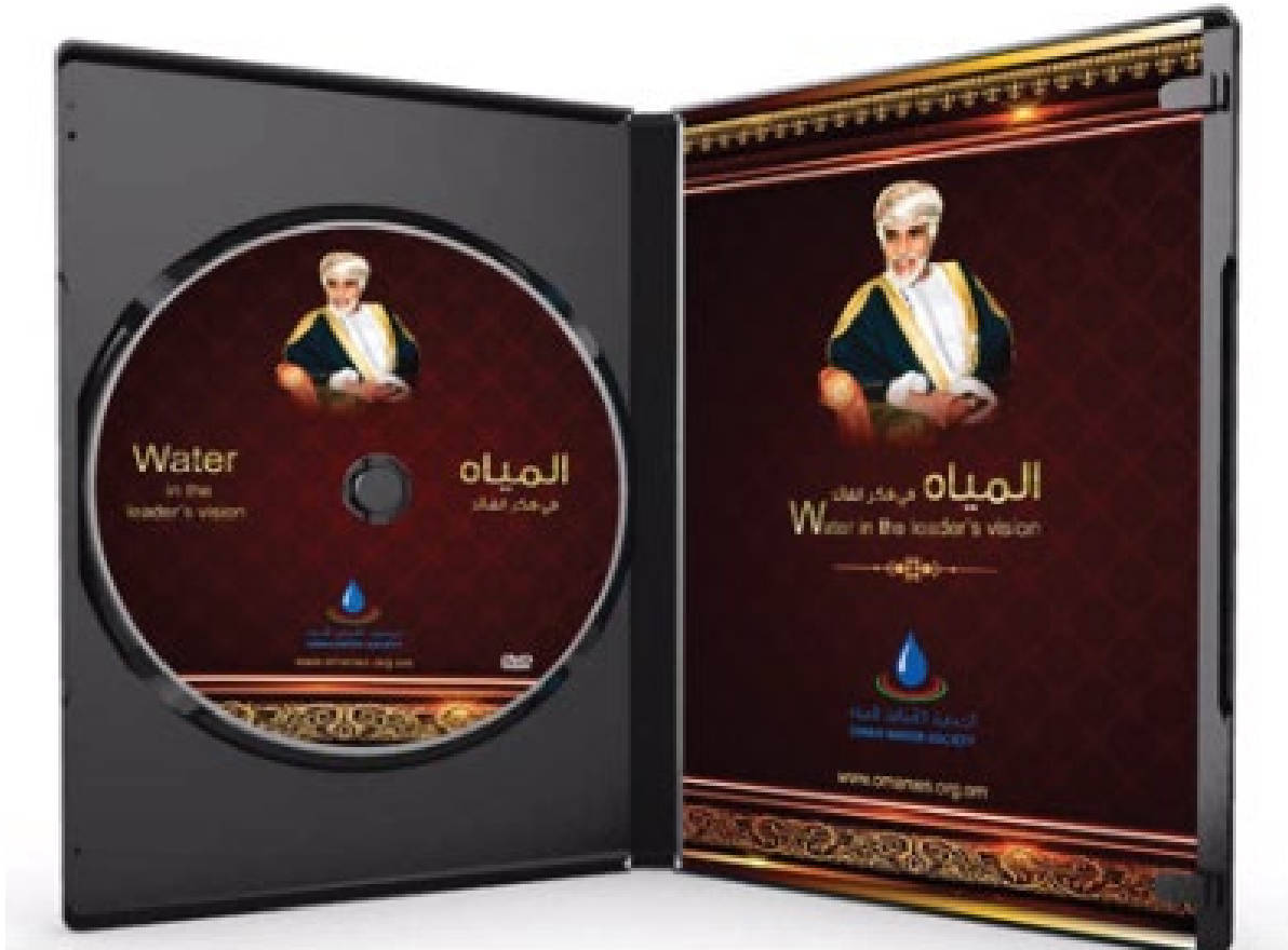
Fig. 2. OWS film water in the leader's vision.