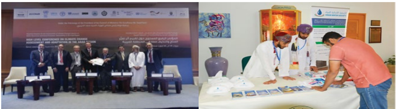
Fig. 9. OWS members participation in the international events.