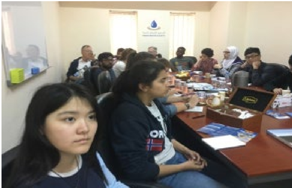
Fig. 7. Meeting with researchers at the OWS premises.