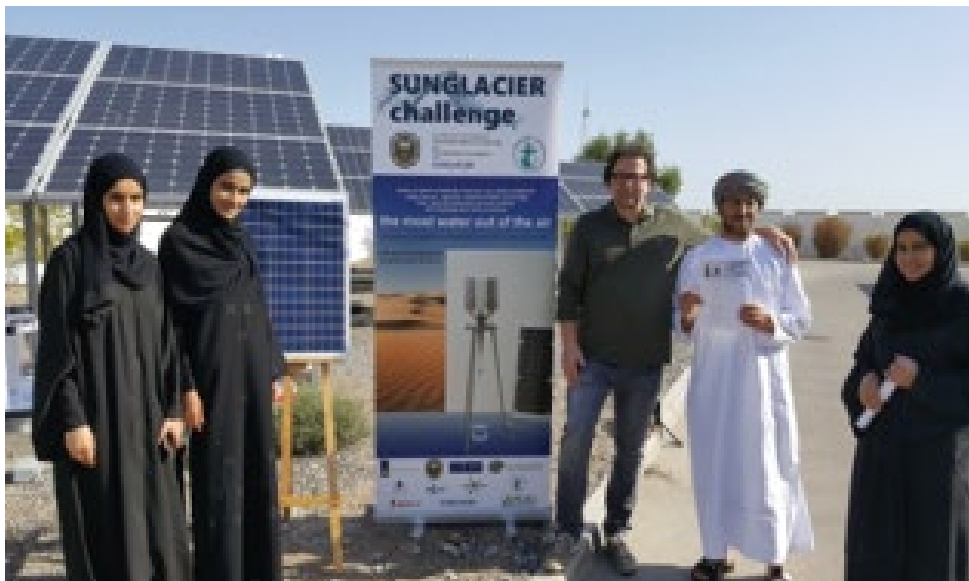
Fig. 6. Partnership with Sultan Qaboos University in Research Projects.