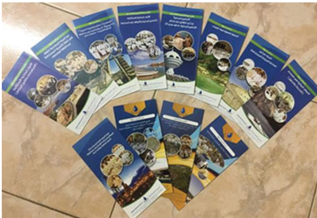
Fig. 3. OWS symposium brochures.