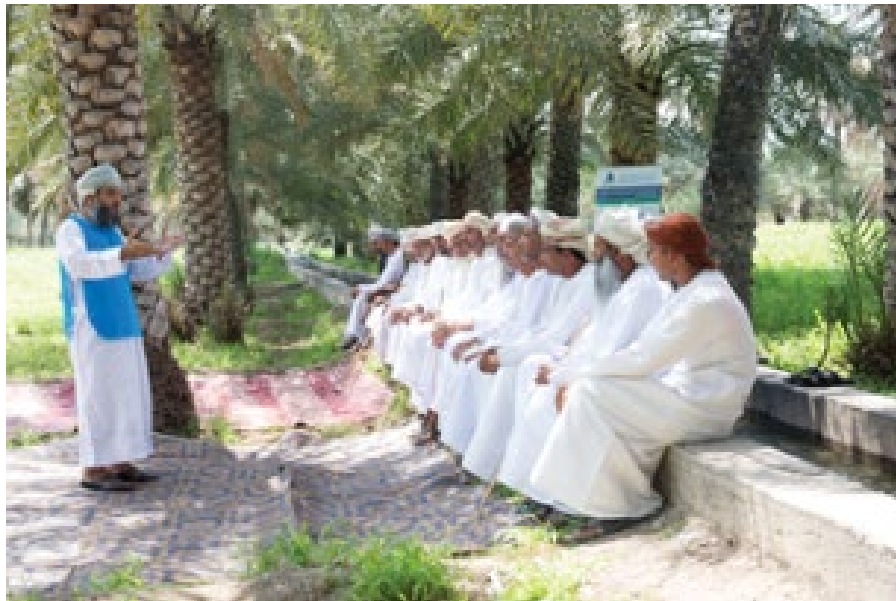
Fig. 5. Lectures delivered to farmers by one of the OWS members.