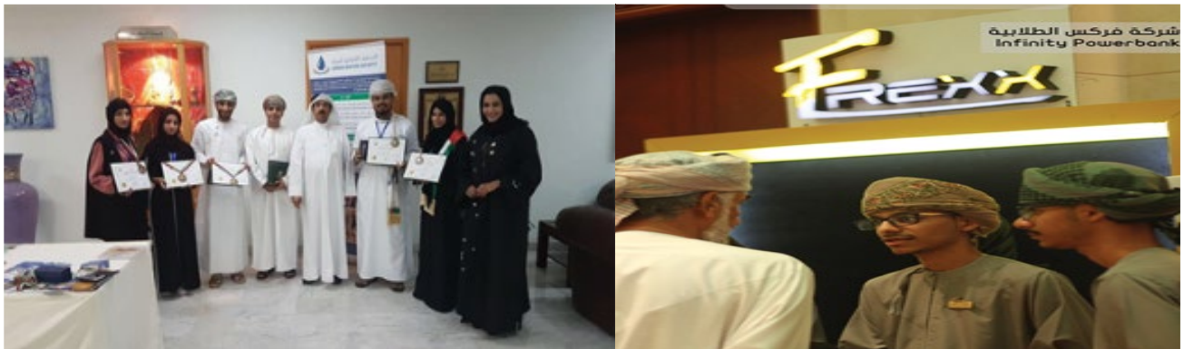
Fig. 8. Innovation initiative and supporting the innovators.