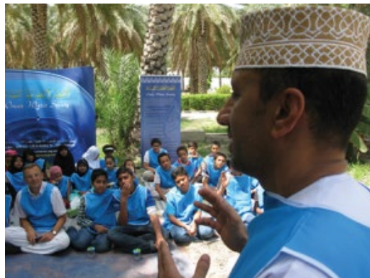
Fig. 4. Awareness campaigns for students.